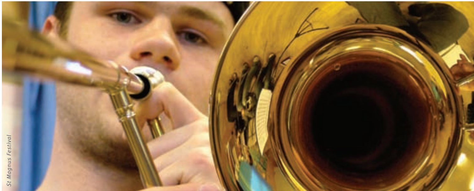
St Magnus Festival