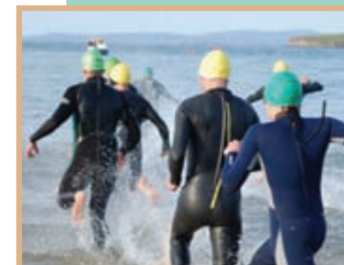
Middle distance triathlon