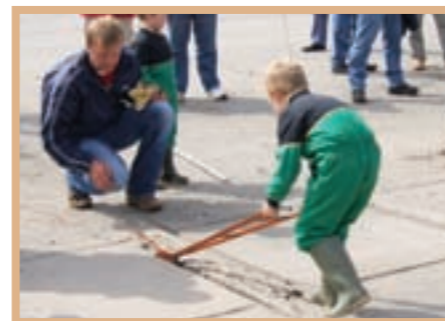
Boys' ploughing match

Flower and vegetable show including floral art and juvenile sections