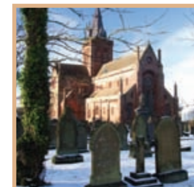
St Magnus Cathedral

Crowds gather in Kirkwall and Stromness before 'the bells' at midnight. The clock of St. Magnus Cathedral on the Kirk Green, and the ships' whistles in Stromness Harbour let us know when to raise our glasses, and to go 'First Footing' to bring in the New Year in traditional style.